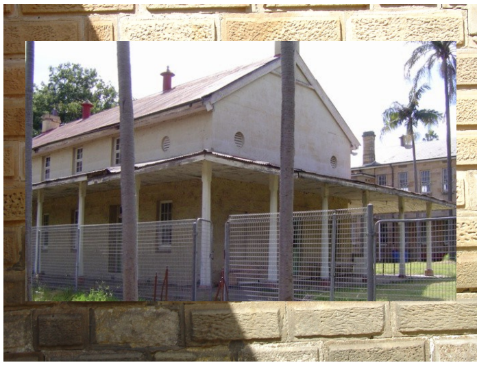
3rd class sleeping quarters—Building 105

SAVE THE PARRAMATTA FEMALE FACTORY Precinct